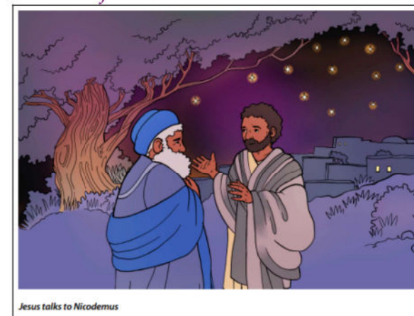
Jesus talks to Nicodemus